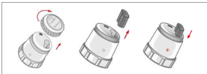
Fig. 4 – Battery replacement procedure