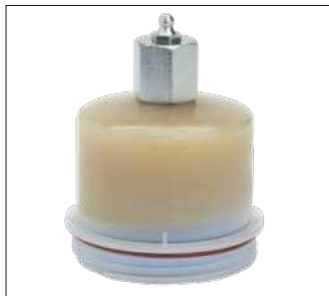
Fig. 2 – Filling adapter