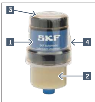
Fig. 1 – TLRD device and components