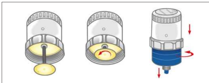
Fig. 3 – Pressure plate positioning