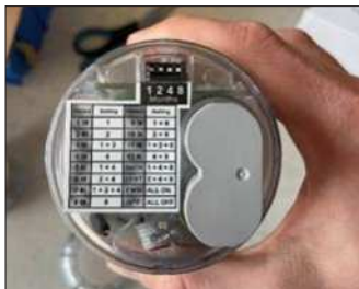
Fig. 5 – DIP Switch and respective settings table

The SKF TLRD lubricator is equipped with a test mode which enables users to test the lubricator before use. To start the test mode before operation, please follow the steps below: